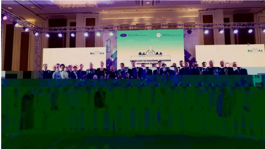
▲ 中税协代表团合影