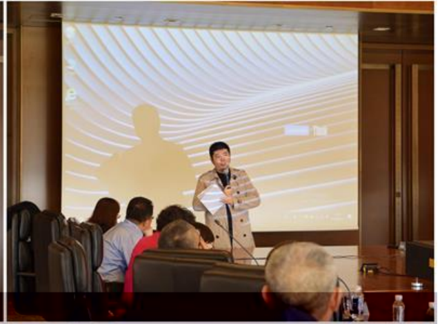
2014 APEC 2017